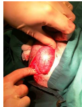
Figure 2: Retroflexed Bladder.

Suspicious of a condition called a Perineal Hernia, Wally was taken to theatre to reduce and repair the hernia. A hernia is a gap in the normal anatomy, ie a 'hole' in the muscle or the body wall through which fat and sometimes abdominal organs can prolapse. Perineal Hernia is usually seen in older male dogs which haven't been castrated - it is thought that an enlarged prostate gland can cause excessive straining which will cause the hernia.