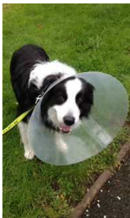
Figure 3: 'Wally' post-op.

Our surgical team were able to reduce the bladder and prostate back to their normal positions and to repair the hernia, so Wally can look forward to leading a normal life.