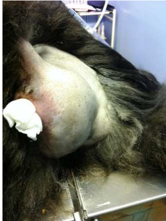
Figure 1: Perineal Hernia.

This is a picture of Wally (name changed to protect his identity!) who came to us with a significant swelling around his back end, as you can see.